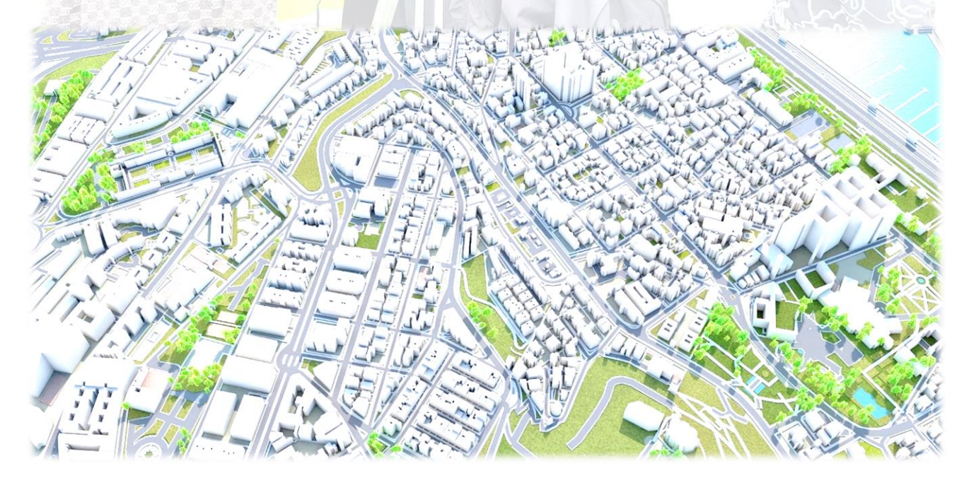
Fig. 3: A 3D Web Map Application