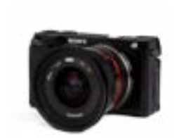
Oblique Sony a6100 3D mapping camera