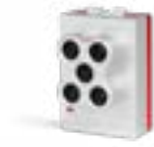
MicaSense RedEdge-MX Industry-leading multispectral sensor