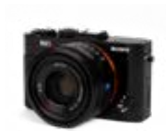
Sony RX1R II